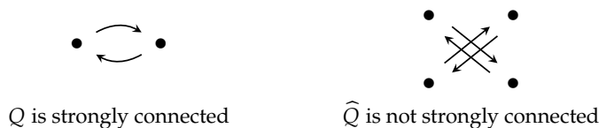
Figure 3.1: On the strongly connected condition

REMARK 3.3. Regarding Proposition 3.2(iv)(b), being strongly connected does not necessarily imply that \widehat{Q} is strongly connected, as shown in Figure 3.1 below.